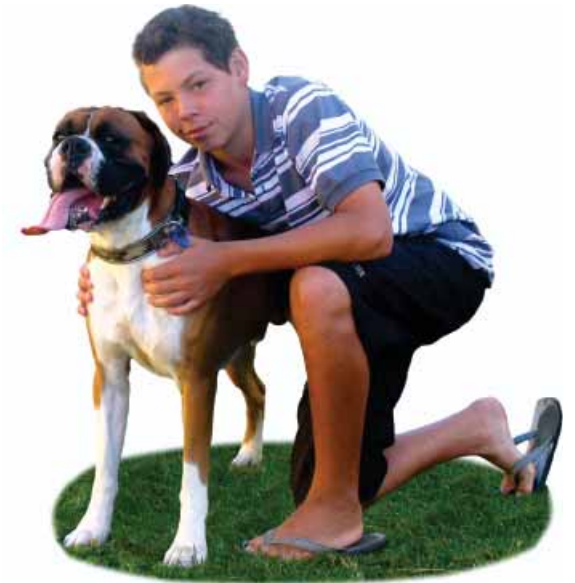
Photo: Zander, the 2008 Poster Dog with his owner

Please note that the winning photo and details will be submitted to the local papers for publishing along with a press release. The winner may also be required to have their photo taken for the papers. When submitting your photo you are allowing Council to use this photo in posters and other promotional material.