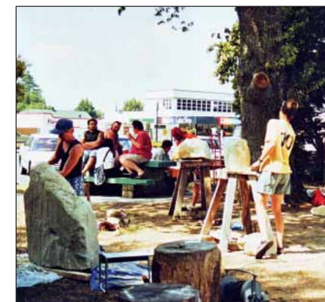
Photo: Sculptors at work

During the year it is planned to publish a book showing a pictorial history of the symposium. This will give the opportunity to remember past sculptures and sculptors. The publishing date will be advertised later.