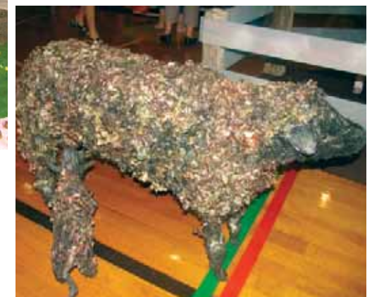
Ewe and lamb featured as part of the amazing 'Cream of the Country Saleday' display, which included people, sheep, cows, pigs and more all made of natural materials