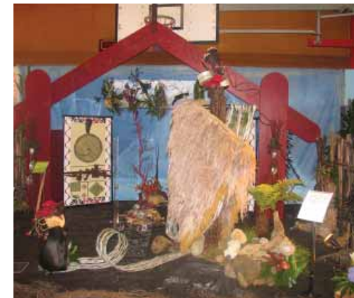
Iwi - The King Movement depicts an important part in our history