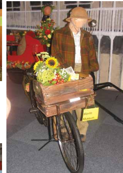
Morrinsville icon Chopo featured as part of the Morrinsville Streetscape