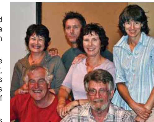
Photo: The cast of The Amorous Ambassador

This is a play that you won't want to miss! It opens on Saturday 3rd May and runs until May 10th at the Little Theatre in Matamata. See upcoming events for details.