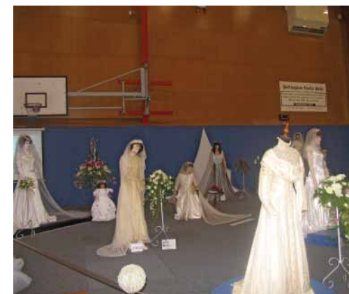
A special centennial display of 'Brides through the Century' displaying dresses, hair styles and bouquets from each period