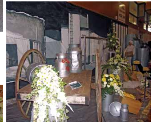
The Lockerbie Dairy Co-op display pays tribute to the dairy factory that ultimately became Fonterra and still plays an important part in our economy