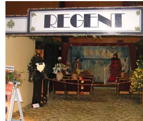
Saturday Night at the Theatre recreates the old Morrinsville Regent Theatre, including icon owner Jack Munro

Morrinsville was blooming beautiful in April when the Flower Festival displayed brilliant colour and creativity during its tri-annual flower festival. The festival featured over 20 fantastic displays all made from plant materials.