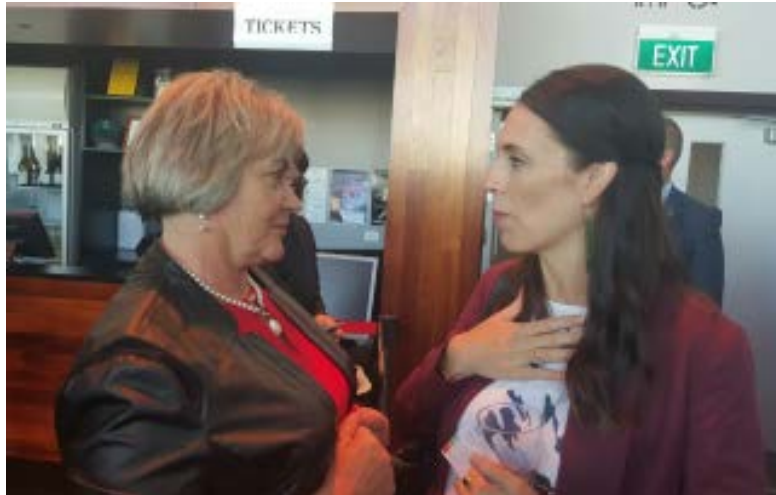
Mayor Jan and Prime Minister Rt hon Jacinda Ardern at the Provincial Growth Fund launch