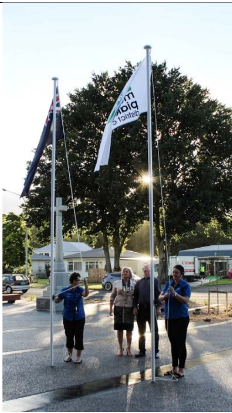
Raising the flags outside the office for the first time