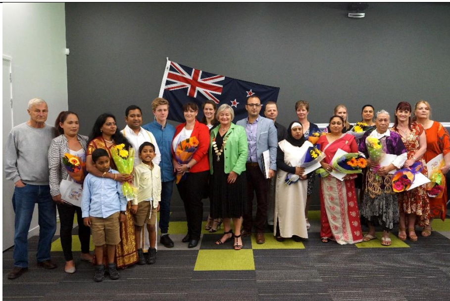
Our new Citizens at the final ceremony for 2018