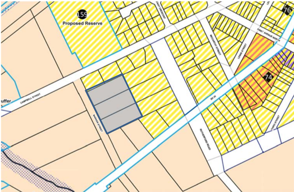
Figure 2 – Proposed Settlement