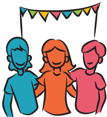
By the community for the community

Pride of Place (POP) is a project that works directly with community to develop aspirational goals for their towns. Delivering on those Place Goals is a key part of this project and it does so in three distinct ways.