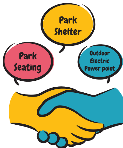
Small scale infrastructure and Council process changes