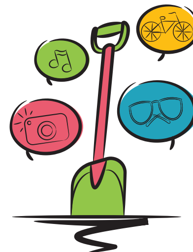
Activate and support new and existing Council projects