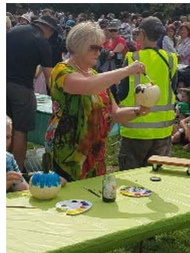
Pumpkin self portrait painting